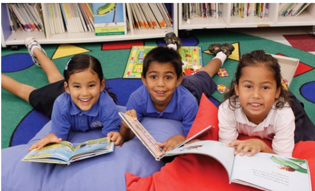
More than 5,350 students, including these learners from KS Maui Elementary, were served through Kamehameha Schools campus programs in fiscal year 2010.

Many national studies of long-term preschool impact show that the benefits of preschool generally diminish throughout elementary school, however the findings from this study show a sustained positive impact of KS preschools well into middle school.