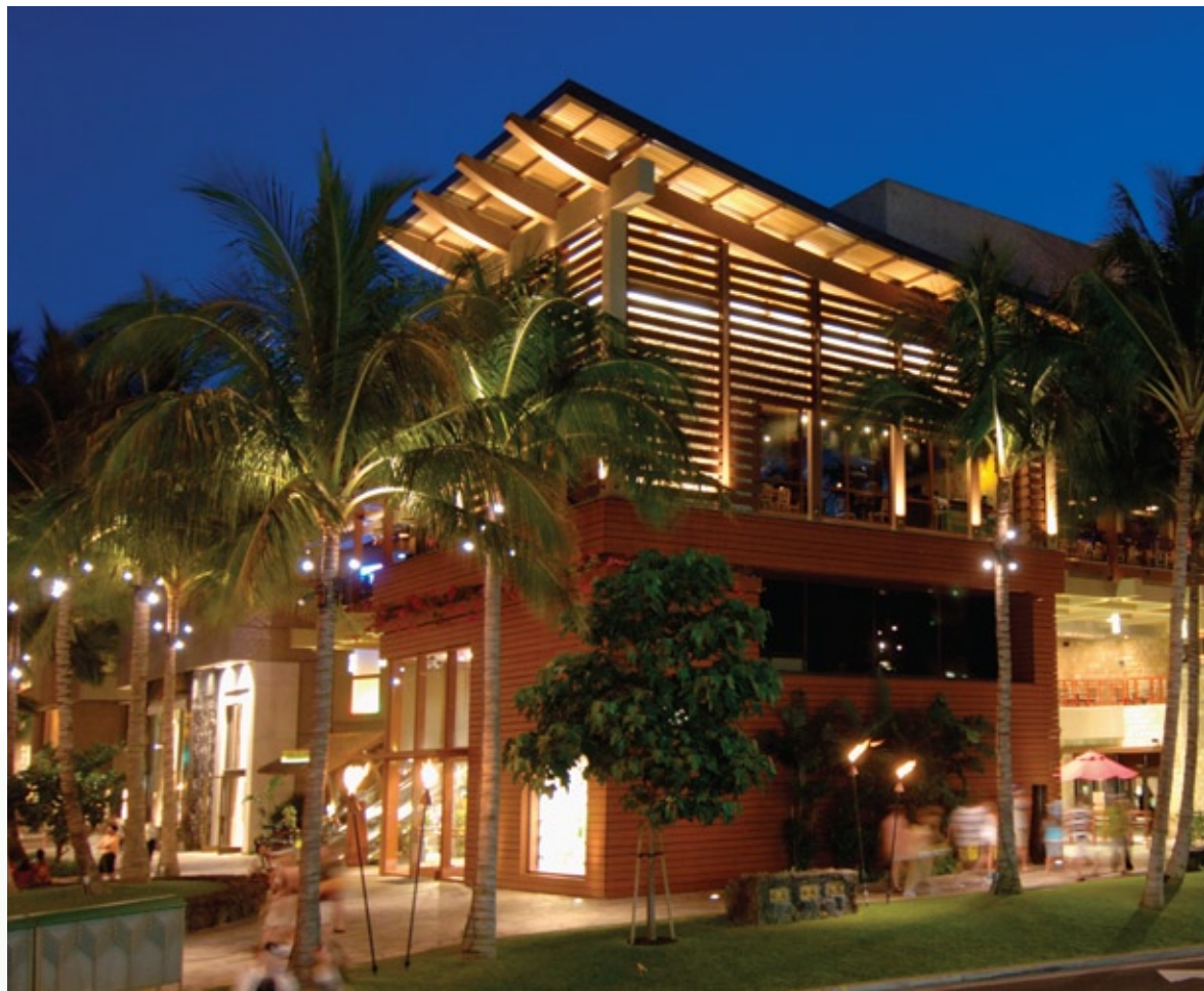
Kamehameha's Royal Hawaiian Center was awarded the 2010 Shopping Center of the Year Award from the International Council of Shopping Centers Hawai'i Chapter. The award is presented each year to a leading individual in the retail profession or to a shopping center based on its excellence in service, design, community and industry involvement.

The first is the most basic one: we want to achieve a 5.0 percent premium over the long term CPI (consumer price index) rate, which equates