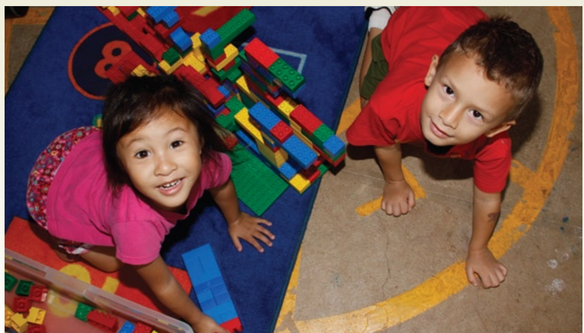
In fiscal year 2010, Kamehameha Schools operated 31 preschools on five Hawaiian islands serving 1,500 students.