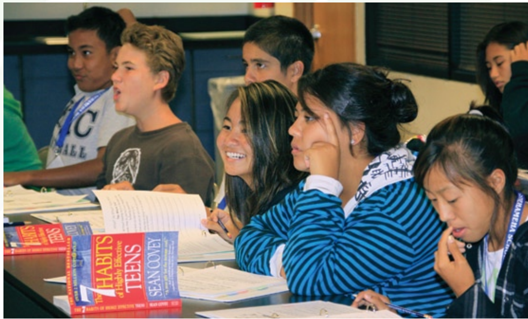
Kamehameha Scholars, a supplementary enrichment program with a focus on college and career guidance, served nearly 500 students who do not attend Kamehameha Schools in fiscal year 2010.

However, throughout the evaluation stage