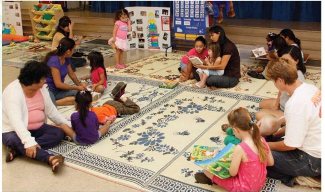
Keiki Steps, an INPEACE program, is a free preschool program open to parents and caregivers with children 0-5 years of age.