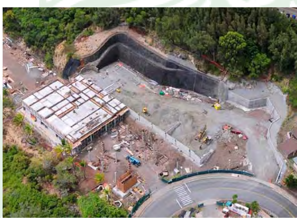
Construction continued on the $118 million Ke Kupu Mālamalama project during fiscal year 2011. Here, the hillside has been cleared to make room for Ka'iwakīlomoku, which will be Kamehameha's new Hawaiian cultural center.