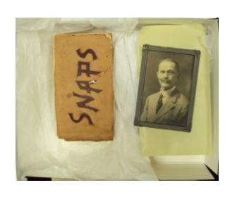
Box 17. Assorted photographs