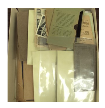
Box 15. Loose negatives and photographs