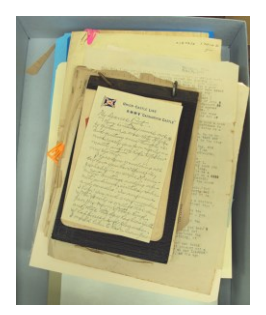
Box 18. Photographs. Books, Letters, News clippings