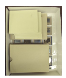
Box 12. Negatives and slides