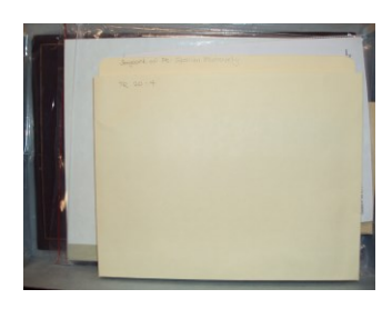
Box 20. Assorted items