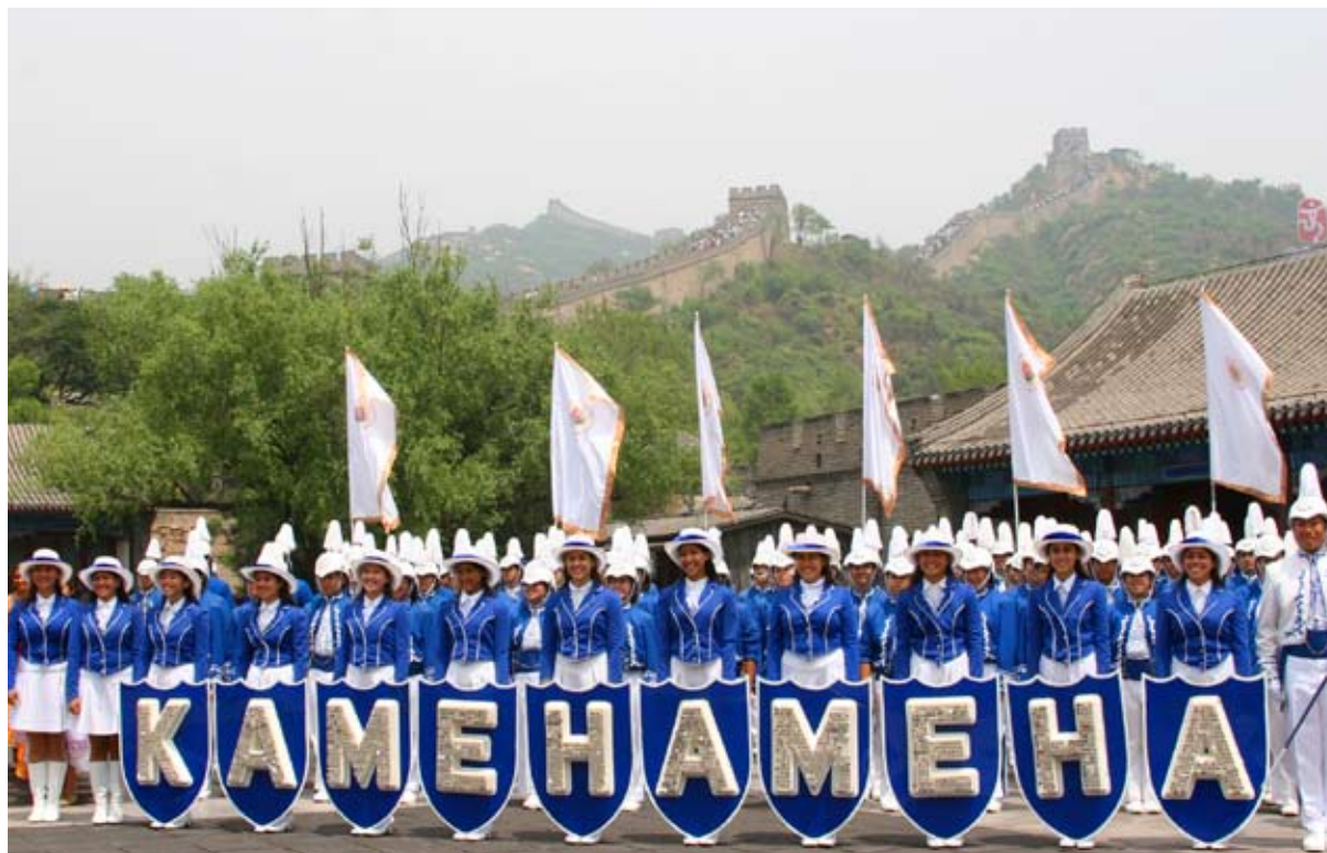
Kamehameha students perform at the entrance to the Great Wall of China.