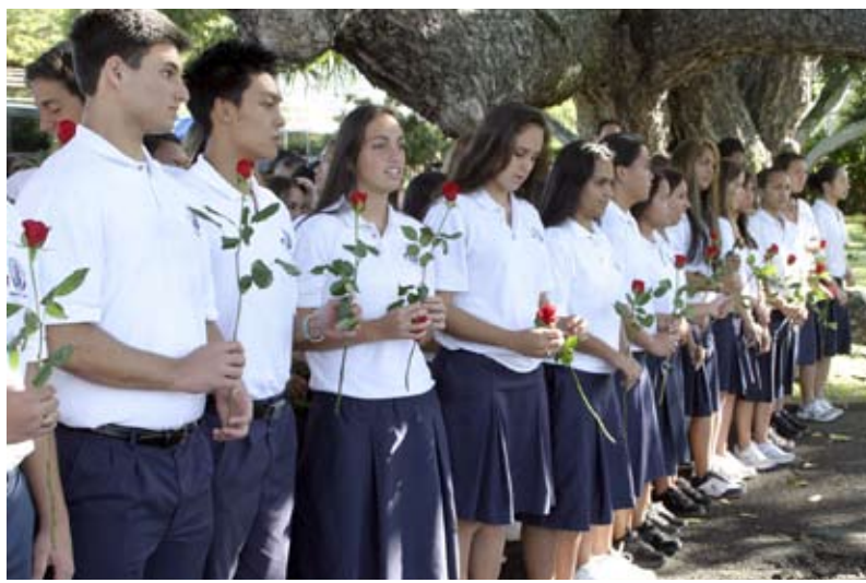
Hawai'i Campus students offer a rose for Pauahi as they prepare to enter Mauna'ala for a May 25 service along with Maui campus pupils. Students from all three Kamehameha campuses then participated in a Joint Worship Service at the Bernice Pauahi Bishop Memorial Chapel on the Kapālama campus.

"People forget that on the neighbor island campuses, we basically went from about 170 students to 1,100 students over the last five years. That type of growth is unheard of! It's an amazing thing, and represents