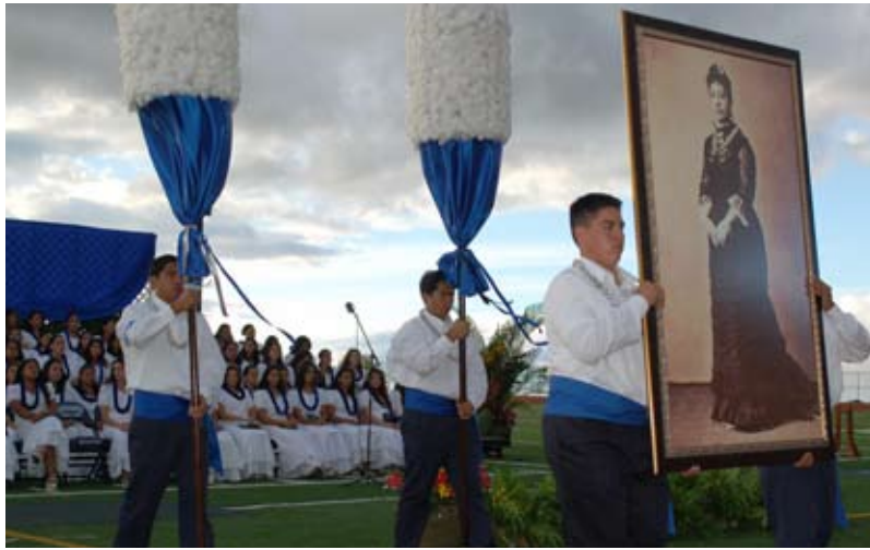
Maui Campus students honor Pauahi.