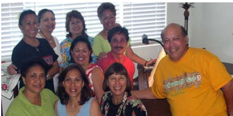
KS '67 40th reunion committee.

I Mua welcomes news from individual Kamehameha classes. Please target announcements on class reunions, fund-raising activities and class celebrations to 150 words. Photos of class activities will be published on a space available basis. Please see "Submissions" information on page three. Mahalo!