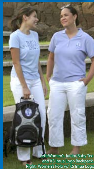
Left: Women's Junior Baby Tee and KS Imua Logo Backpack. Right: Women's Polo w/ KS Imua Logo

Most items are available only online. A great way to send gifts to loved ones outside of Hawai'i.