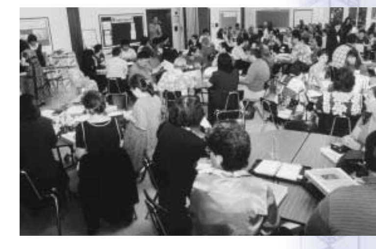
The planning process engaged a wide spectrum of the Kamehameha 'ohana and Hawaiian community.

The planning process engaged a wide spectrum of the Kamehameha 'ohana and Hawaiian community in the development of this plan. The plan was developed in three phases.