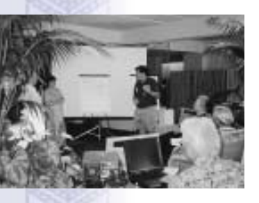
We held 43 community meetings, with over 1,000 attendees, in Hawai'i and the continental United States.